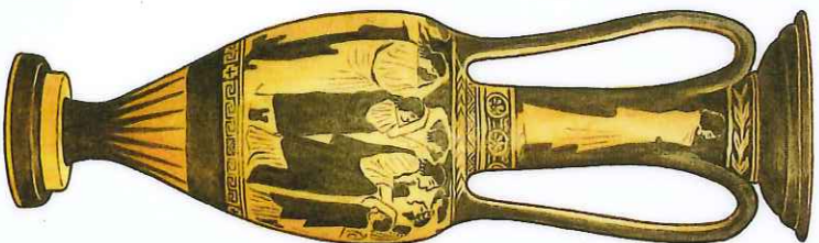
A tall, spindly kind of pot called a lekythos was used to fill the bath which a young bride took before her wedding. The pots were usually painted with scenes of weddings or funerals. Women who never married had these pots placed as markers over their graves.

Funerals were important events in ancient Greece. The family of the dead person came together to grieve and pray to the gods. The body was prepared for burial with precious sweet smelling oils kept in slender clay oil flasks called lekkythoi . The lekkythoi were often decorated with scenes of dead people, especially young soldiers being laid to rest. When the pots were emptied of their oils they were placed on the grave as funeral offerings from the family.