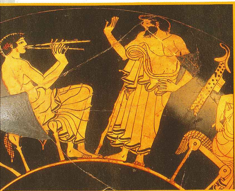
Here a music teacher listens to his pupil play the pipes. The music master's lyre can be seen behind the boy's head.

There were three kinds of teacher. One taught reading, writing, arithmetic and literature, which meant learning long passages of poetry, particularly by the poet Homer (see page 27), by heart. Stories of the great heroes of the past were supposed to make boys want to grow up to be brave too.