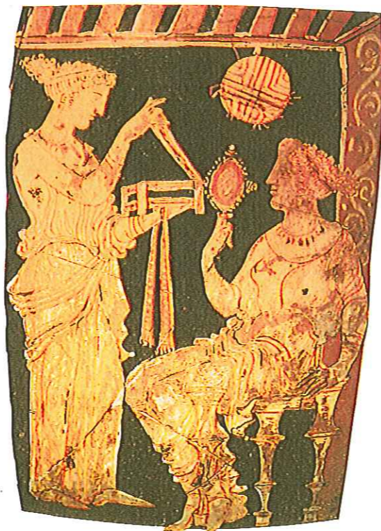
A woman with her maid, who holds the woman's jewellery box. Wives were responsible for training servants and for supervising their day to day work.

It's not easy for a woman to get out and about. She has to look after her husband, make sure the servant girl does her work, tuck the baby up in bed, wash it, feed it... FROM LYSISTRATA , A PLAY BY ARISTOPHANES, WHO LIVED ABOUT 450-385 BC